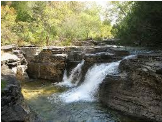
Hercules-Glades Wilderness Area