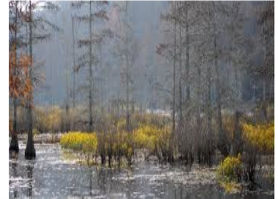
Mingo Wildlife Refuge