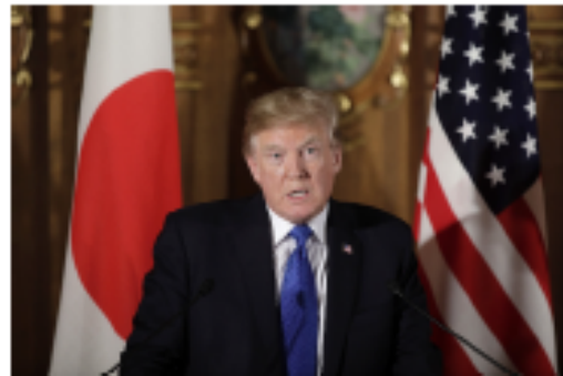
President Trump at a press conference in Tokyo, Nov. 6.

The president is learning how the Constitution works—and he's not happy.