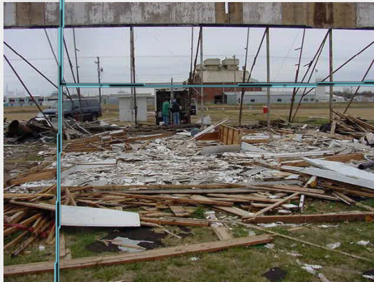
Dilapidated Drive-In Coffeyville, KS