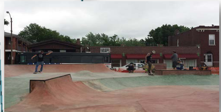
Skate Park St. Louis, MO