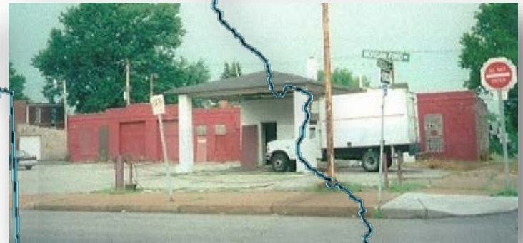
Abandoned Gas Station St. Louis, MO