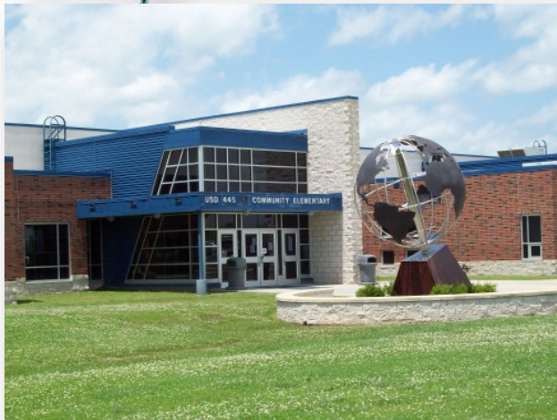
New School Coffeyville, KS