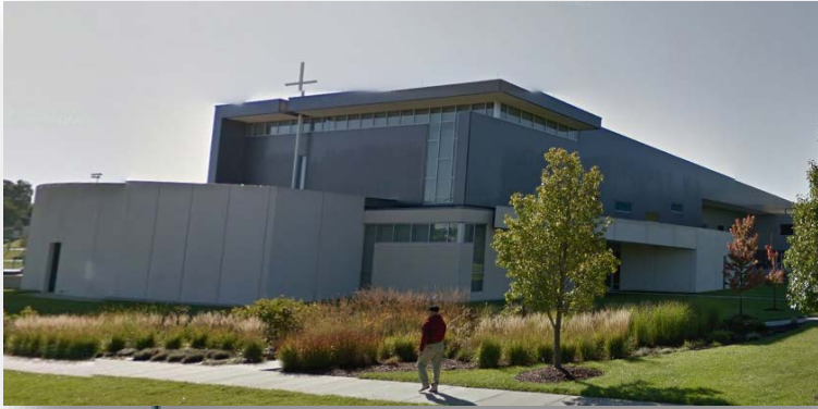
New Community Center Omaha, NE