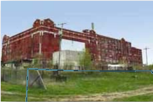
Former Meat Packing Plant Omaha, NE