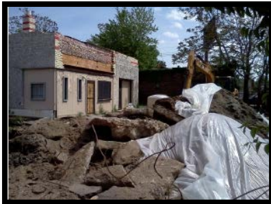
Old Gas Station, St. Louis, MO