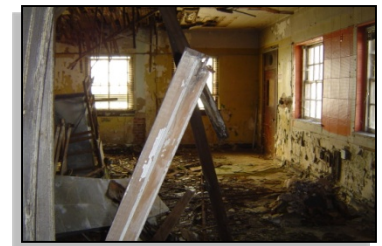
emPower Plant®, St. Joseph, MO