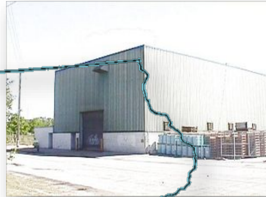
Former Frozen Soup Factory Cedar Rapids, IA