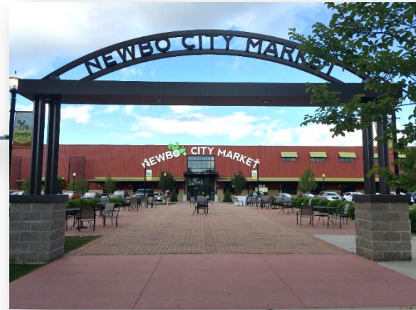
Newbo City Market Cedar Rapids, IA